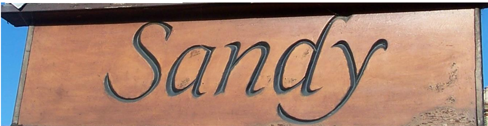
The Sandy sign, which was repaired during 2016

The Committee has continued to review its policies and procedures to ensure they are effective and up to date. This year the Council adopted a new recruitment policy and a Council risk assessment which reviewed all risks borne to the Council.