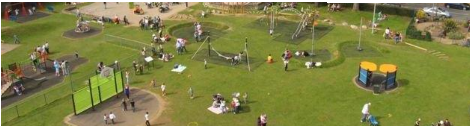
Bedford Road Recreation Ground

The Pinnacle, Sand Lane, Sandy, SG19 2AD