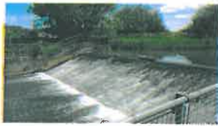
Lock Corner Weir, South Mills Weir and embankments downstream of Blunham Bridges.

Historic modification of the River Ivel for navigation, food production and flood protection between Tempsford and Arlesey have disrupted the natural functioning of the river and the ecology it supports. Many of the structures such as lock pens and weirs, as well as some of the flood embankments are obsolete and offer little flood risk benefit.