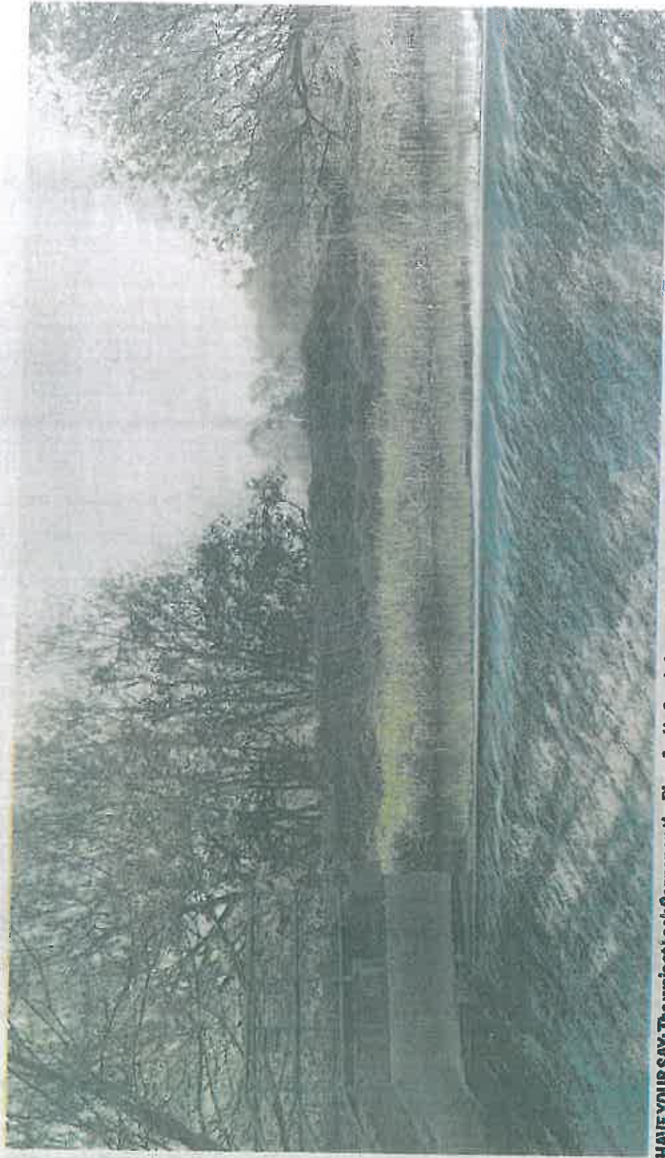
HAVE YOUR SAY: The weir at Lock Corner on the River Ivel in Sandy is earmarked for destruction under 'The Ivel Restoration Plan'.

An Environment Agency spokesperson said: "Over the