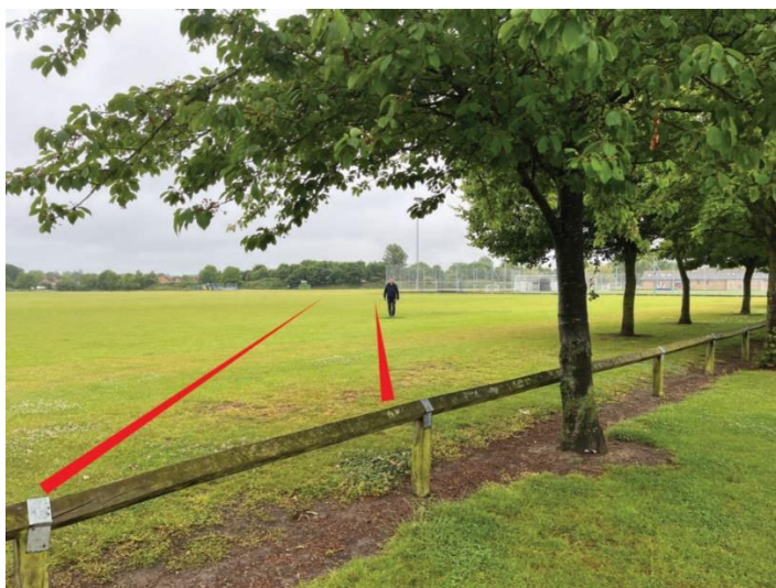
Illustration above shows rough route across the park (for illustration purposes, I am the leftmost goalpost on the pitch being crossed!)

Illustration above shows the usual finish and proposed plot of new finish (actual revised finish point TBC but definitely close to that end of the all-weather pitches)